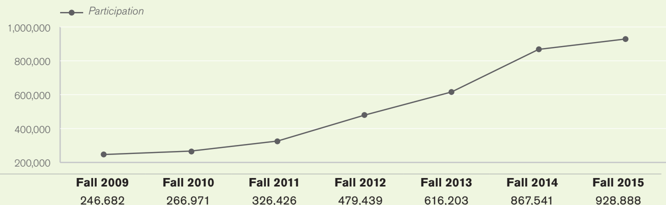
U.S. PUBLIC SCHOOL PARTICIPATION OVER TIME